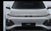
Robot Face Family Design