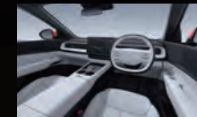
Vector star ring interior design