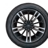
20-inch sport wheel hubs