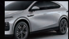
Ultra-low wind resistance pulse curvature